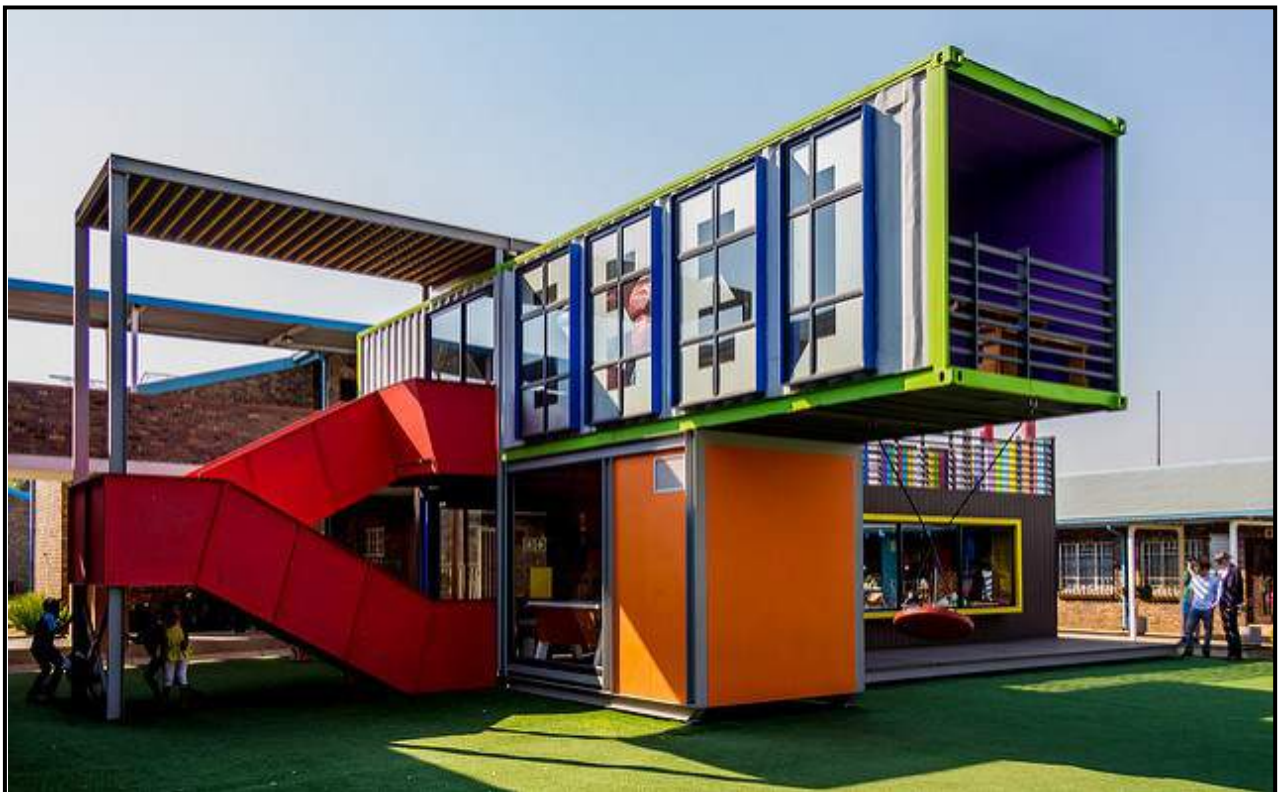
FIGURE 8b: Architects Of Justice, SEED Library II , in Alexandra township, Johannesburg, South Africa, 2010.