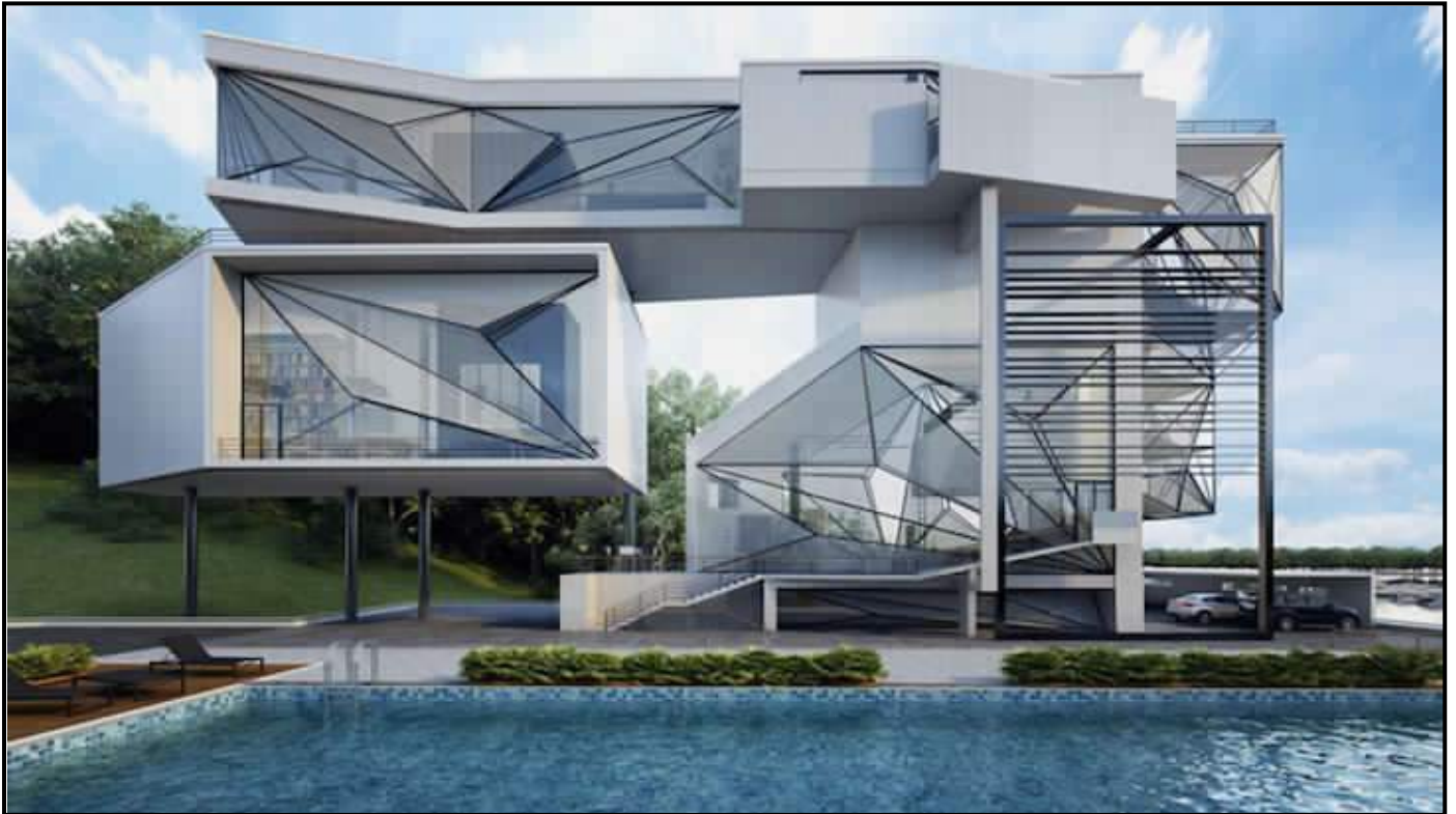
FIGURE 8a: Carlo Enzo (Urban Office), Villa for an Aviator (Pilot) , recycled aeroplane parts, 2016.