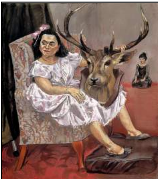
FIGURE 7c: Paula Rego, Snow White Playing with her Father's Trophies , pastel on paper, 1995.