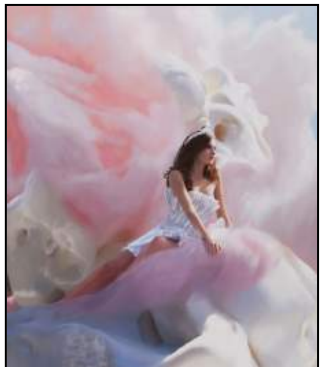
FIGURE 7d: Will Cotton, Beatrice , oil on cloth, 2010.