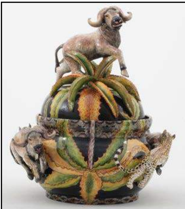
FIGURE 4c: Ardmore ceramic studios, Buffalo Bowl Centrepiece , glazed clay (ceramics), date unknown.