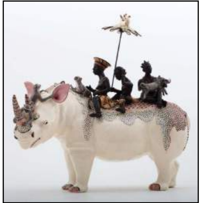
FIGURE 4b: Ardmore ceramic studios, Rhino Riders , glazed clay (ceramics), date unknown.