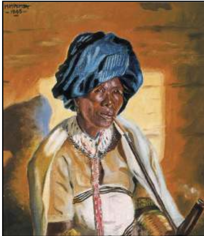
FIGURE 1a: George Pemba, Xhosa Woman Smoking a Pipe , oil on board, 1945.