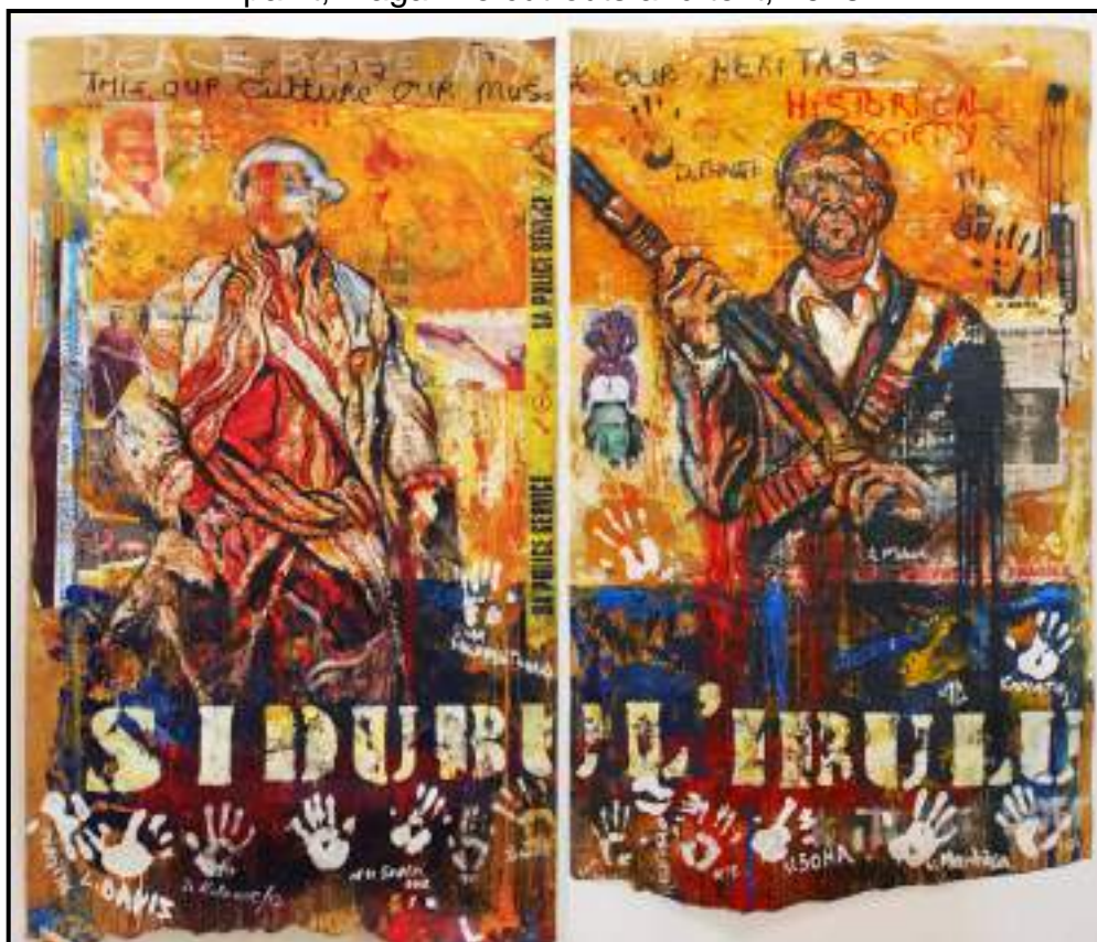
FIGURE 3b: Ayanda Mabulu, Sidubul'ibulu , diptych, mixed media on paper, 2013.