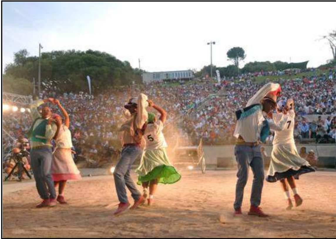
FIGURE 2a: Photograph of Riel Dancers of the Suurrug Suurtrappers from Wupperthal at the annual ATKV competition in the Cape, 2015.