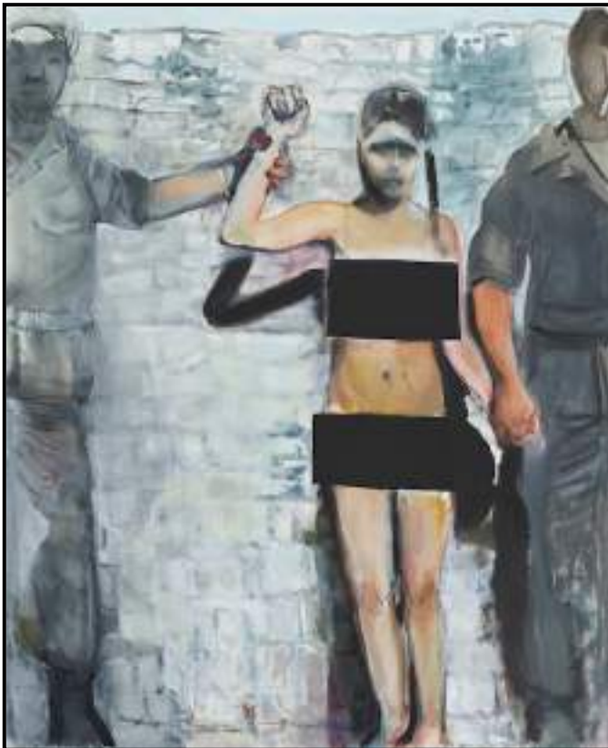
FIGURE 7a: Marlene Dumas, The Trophy , oil on canvas, 2013.