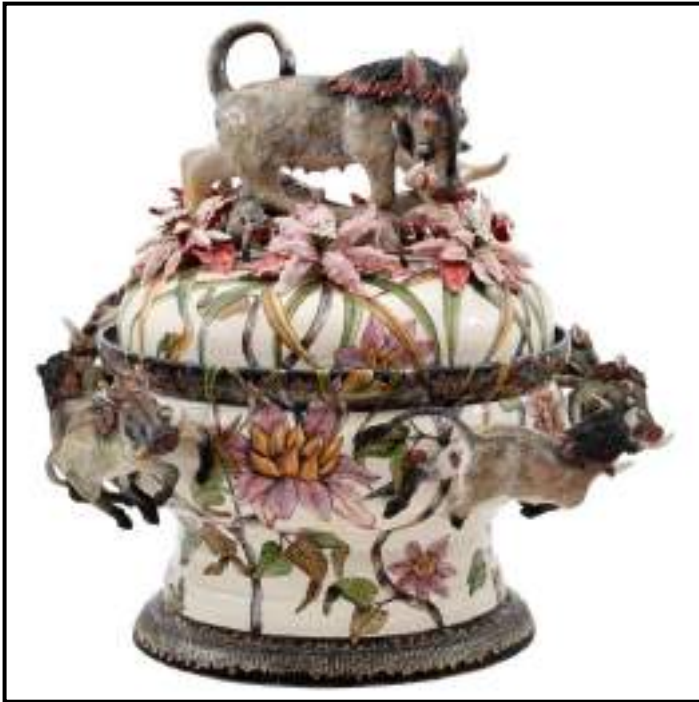
FIGURE 4a: Ardmore ceramic studios, Warthog Bowl Centrepiece , glazed clay (ceramics), date unknown.