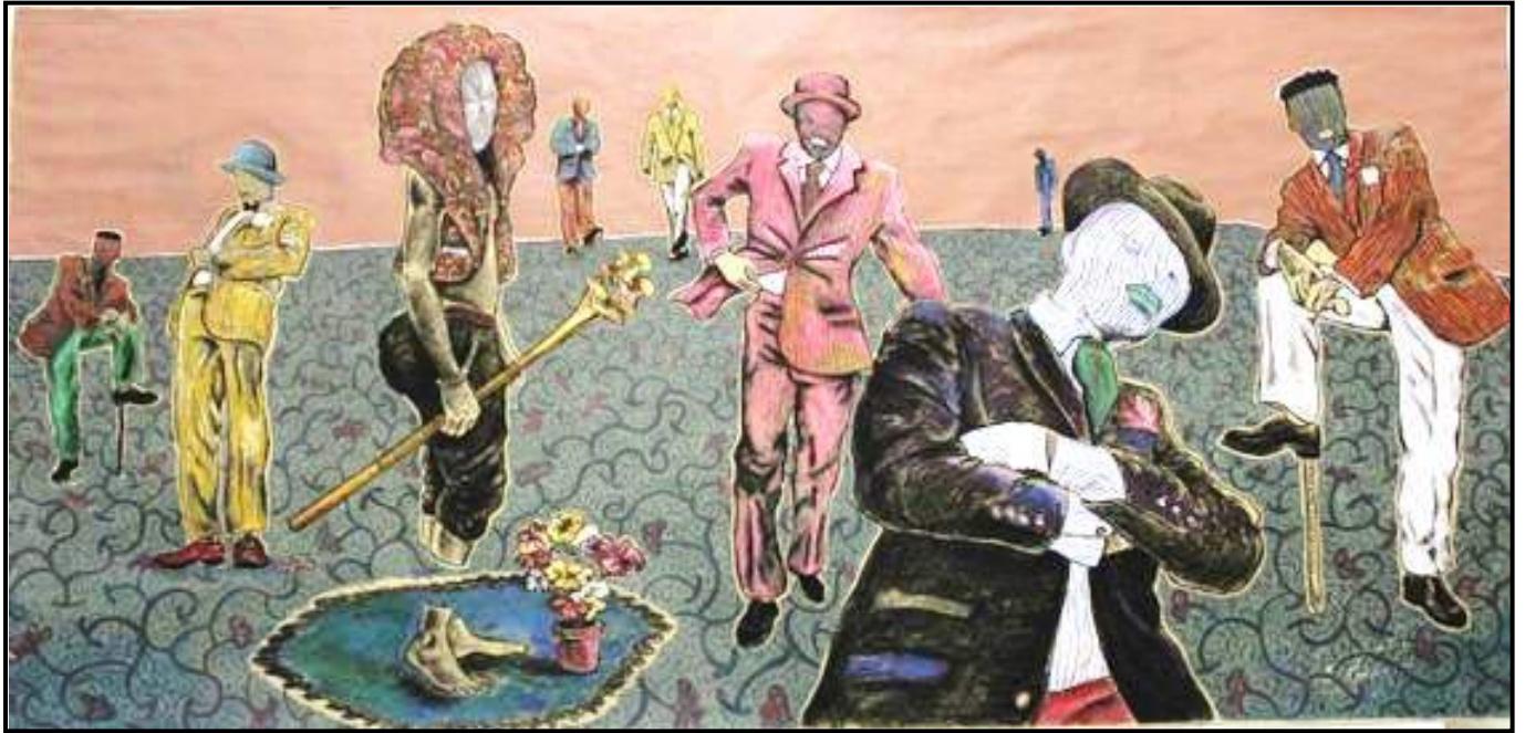
FIGURE 6a: Simphiwe Ndzube, Detail of Sarah and Some Gentlemen , charcoal, collage and acrylics on paper, 2014.