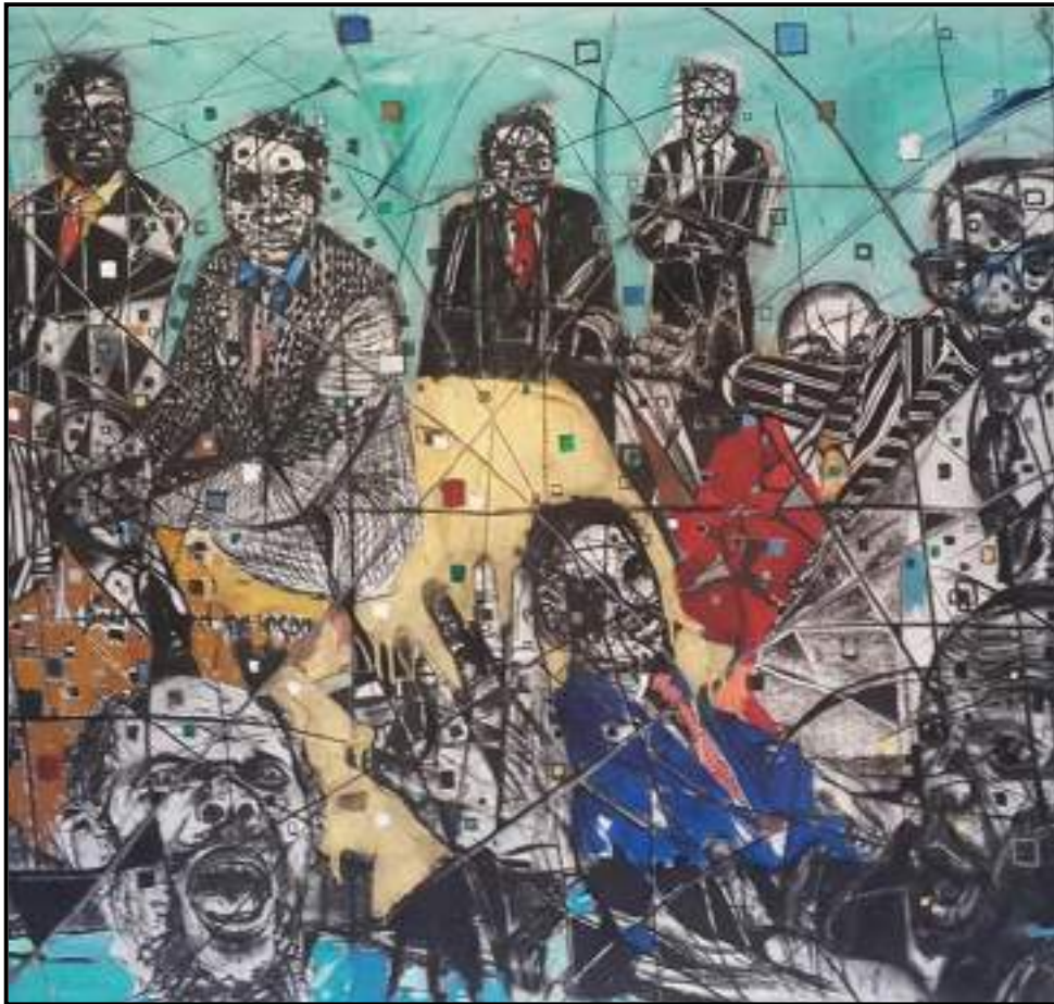
FIGURE 3a: Mpumelelo 'Layziehound' Coka, The Cracks , mixed media, paint, magazine cut-outs and text, 2016.