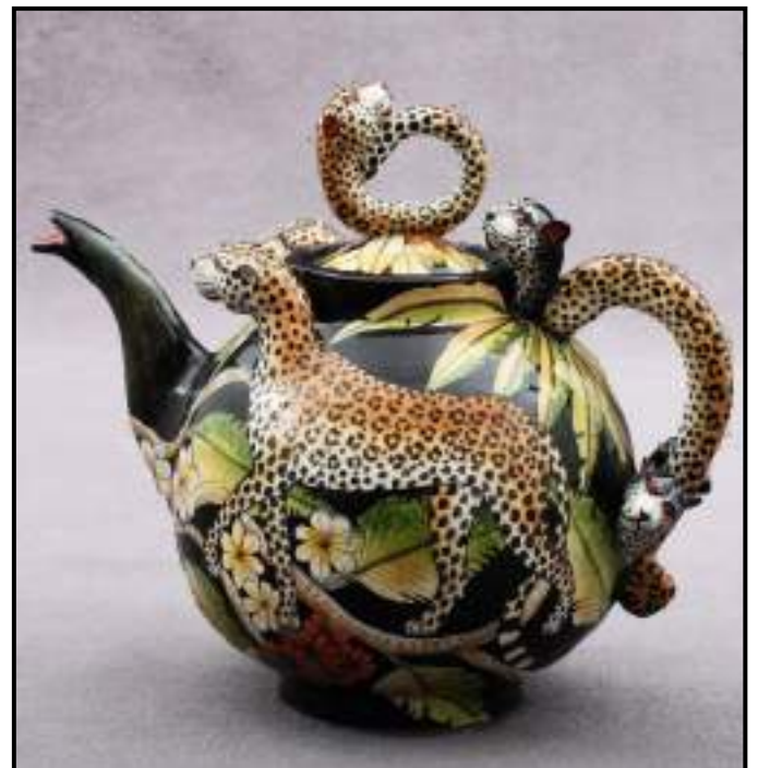
FIGURE 4d: Ardmore ceramic studios, Leopard Teapot , glazed clay (ceramics), date unknown.