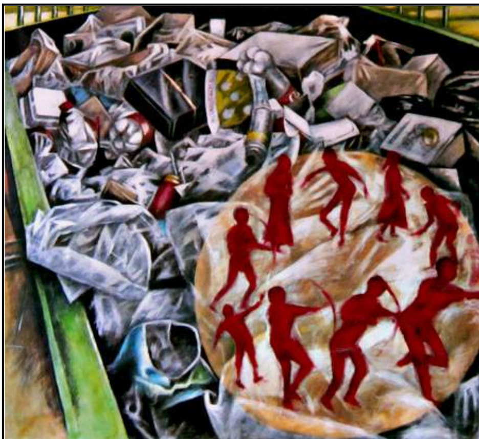
FIGURE 2b: Manfred Zylla, Riel Dans , mixed media on paper, 2013.