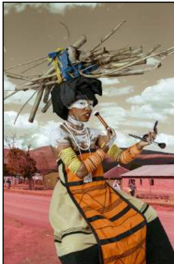
FIGURE 1b: Tony Gum, Ode to She , photograph, 2017.