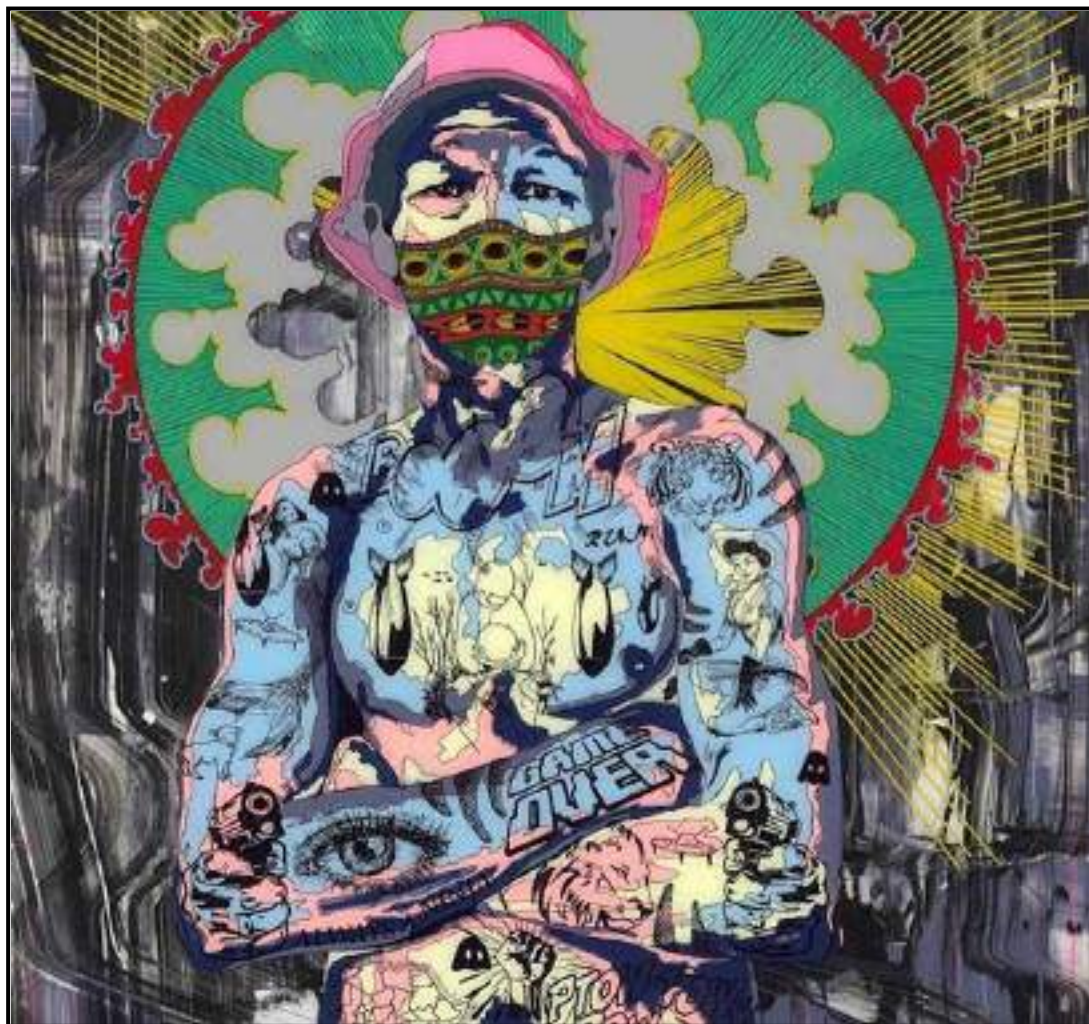
FIGURE 6b: Norman O'Flynn, Timekeeper, 43 , acrylic on glass, 2017.