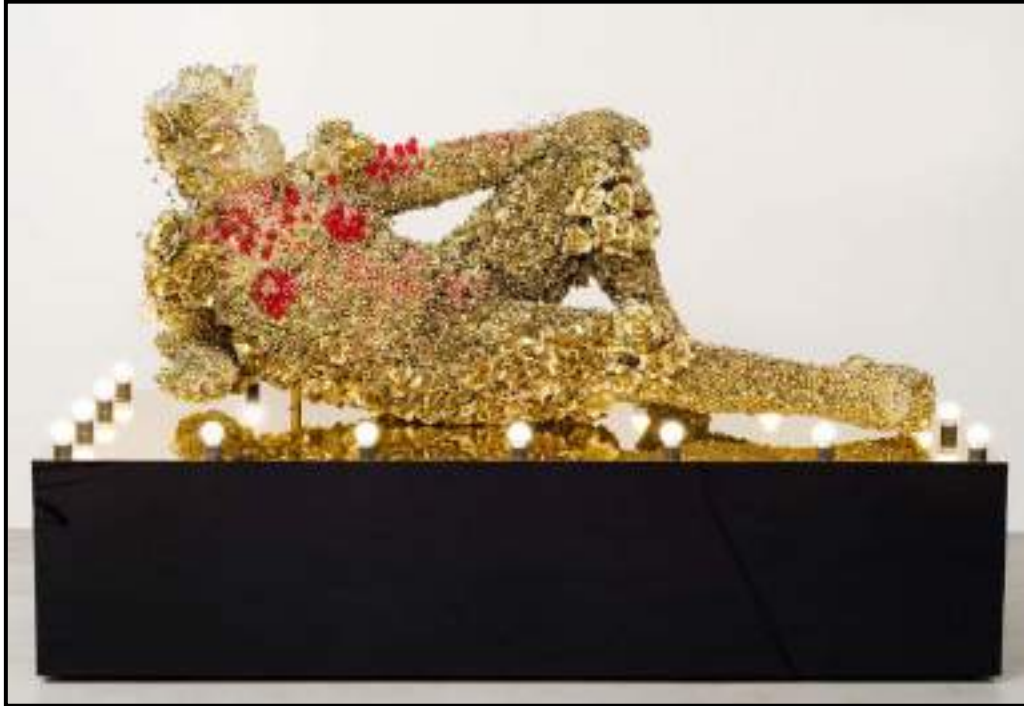
FIGURE 5a: Athi-Patra Ruga, Proposed Model for Tseko Simon Nkoli Memorial , high-density foam sculpture, artificial flowers, jewels, Perspex and light bulbs, 2017.