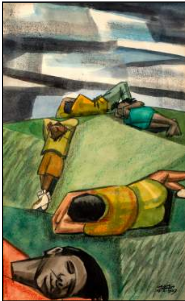
FIGURE 1a: Peter Clarke, Sleepers on the Grass , watercolour, 1967.