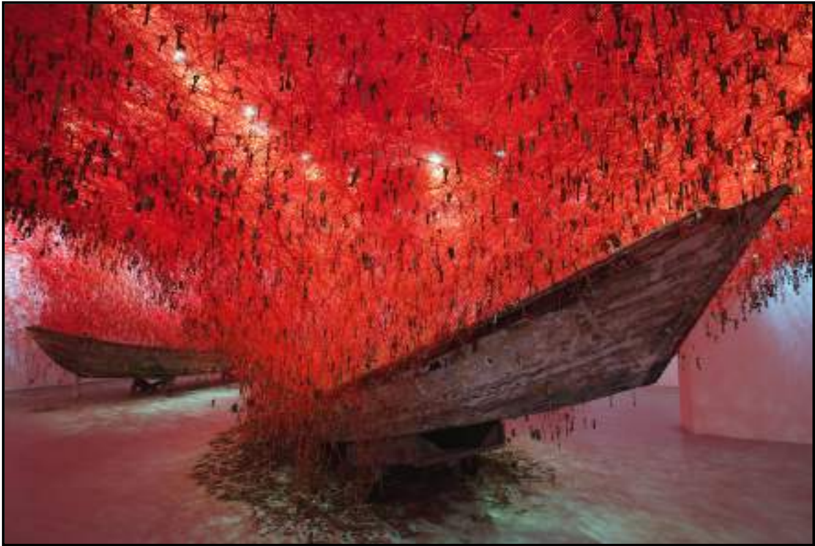
FIGURE 5a: Chiharu Shiota, The Key in the Hand , installation with boats, wool/strings/yarn and keys, 2015.