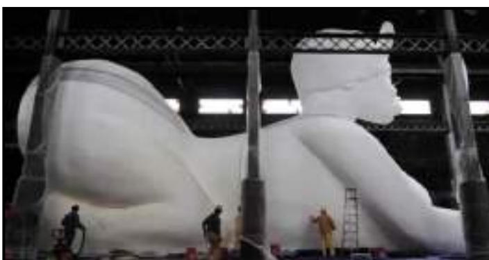
FIGURE 7b: Kara Walker, side view of A Subtlety, or the Marvelous Sugar Baby , polystyrene, molasses and sugar, 2014.