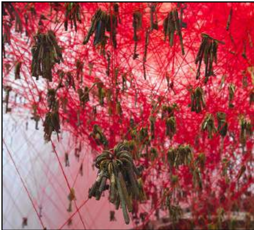
FIGURE 5b: Chiharu Shiota, The Key in the Hand (detail), installation with boats, wool/strings/yarn and keys, 2015.