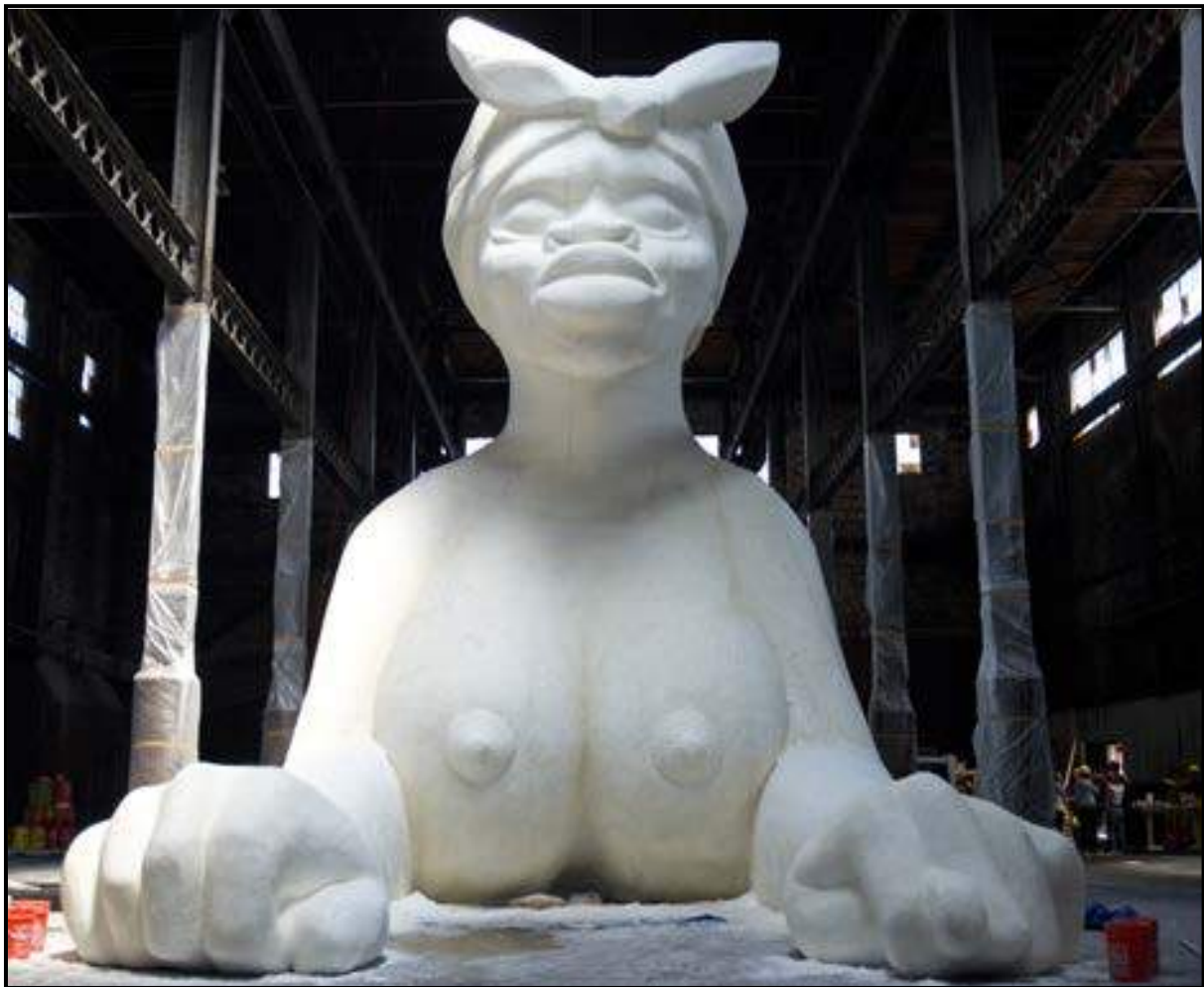
FIGURE 7a: Kara Walker, A Subtlety, or the Marvelous Sugar Baby , polystyrene, molasses and sugar, 2014.