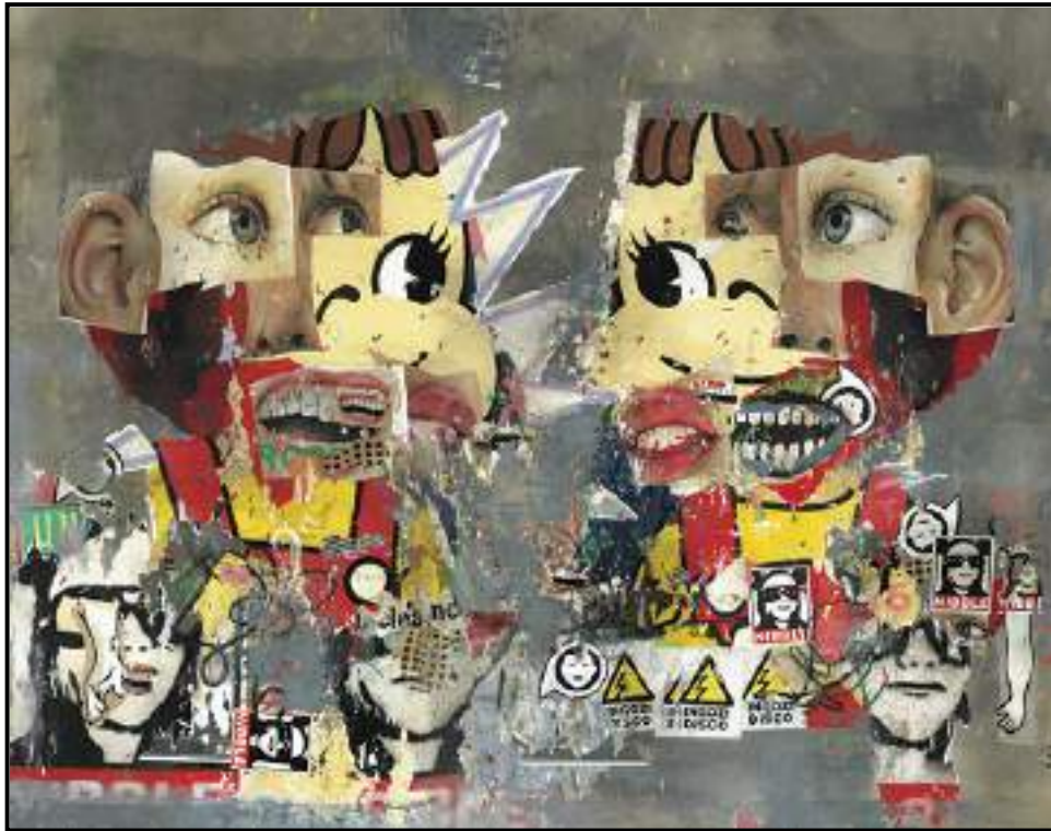
FIGURE 6a: Asha Zera, Mouse over Text , acrylic paint on board, 2008.