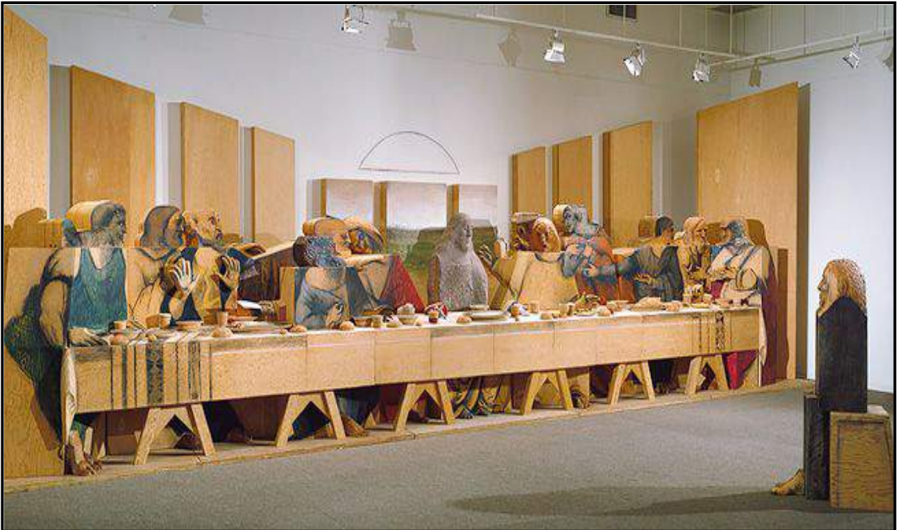
FIGURE 4a: Marisol Escobar, Self-Portrait Looking at The Last Supper , plywood, brownstone, plaster and aluminium, 1982–1984.