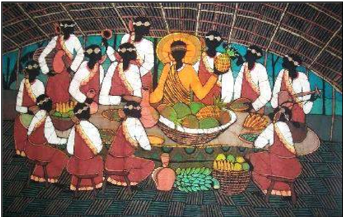
FIGURE 4b: Dominic Lukandwa, The Last Supper , batik on silk, date unknown.