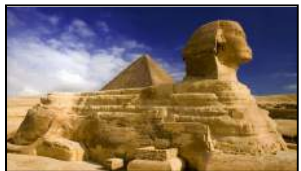
FIGURE 7c: Sphinx of Giza , limestone statue, built during the reign of the Pharaoh Khafra (c. 2558–2532 BC), Egypt.