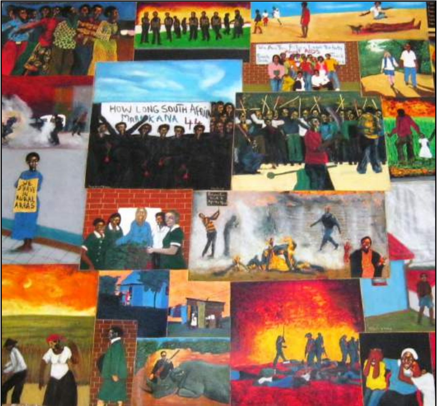
FIGURE 3: Sfiso Ka-Mkame, Letters of Home , oil pastel on paper, 2012–2014.