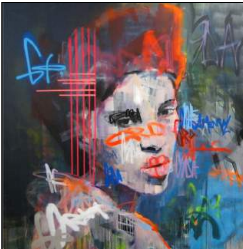
FIGURE 6b: Kilmany-Jo Liversage, Judella 515 , acrylic paint and spray paint on canvas, circa 2010–2015.