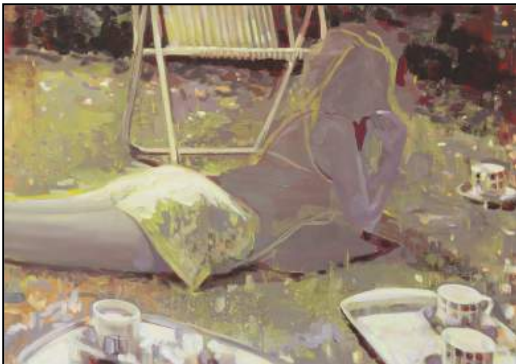
FIGURE 1b: Kate Gottgens, Summertime , oil on canvas, 2015.