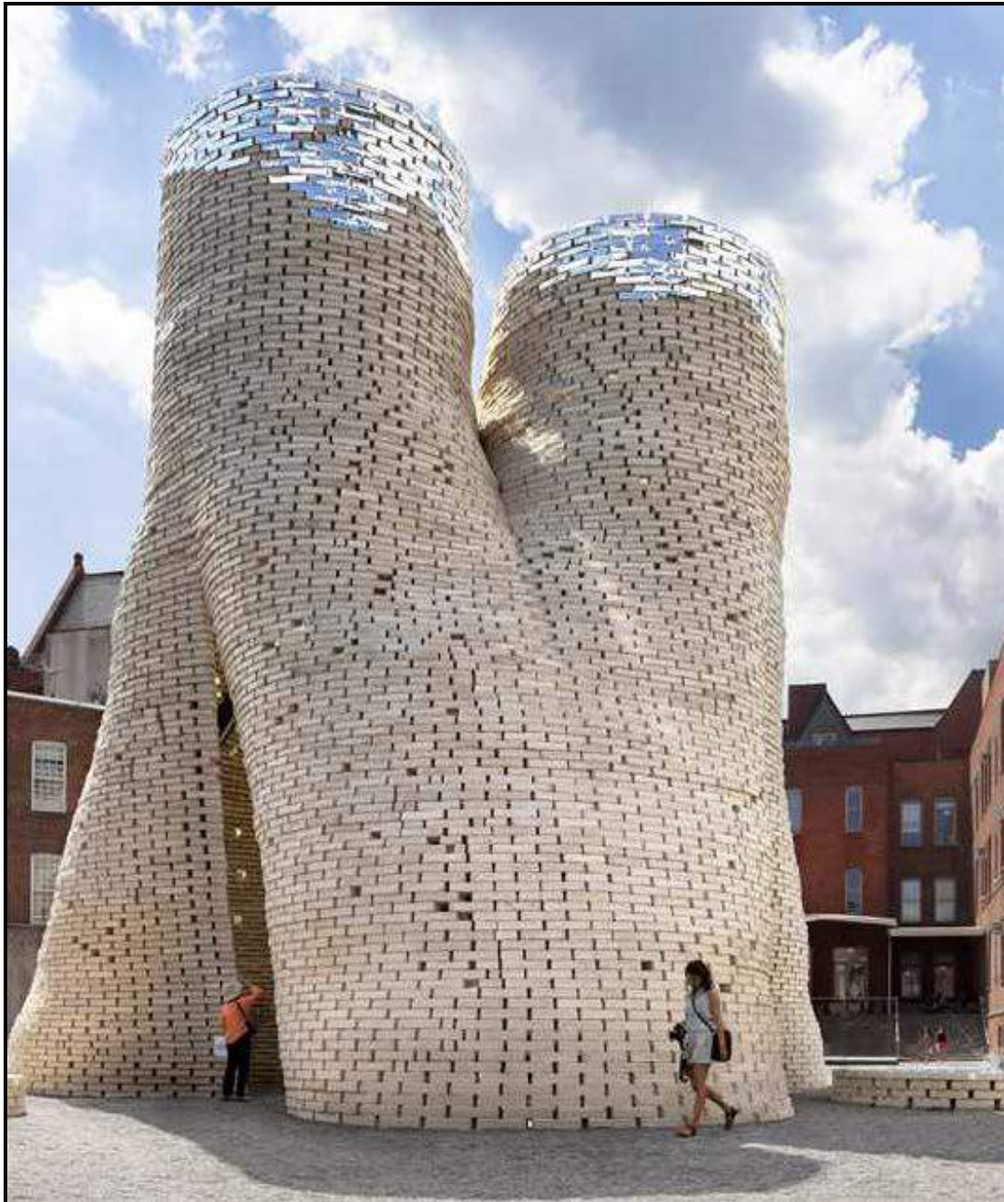
FIGURE 8: 15 th edition of YAP (Young Architects Program), Hy-Fi . The temporary structure will be built using 3M reflective bio-design organic bricks, made from corn stalks and living root structures. The bricks will be used as growing trays before being used in the structure. Long Island City, 2014.