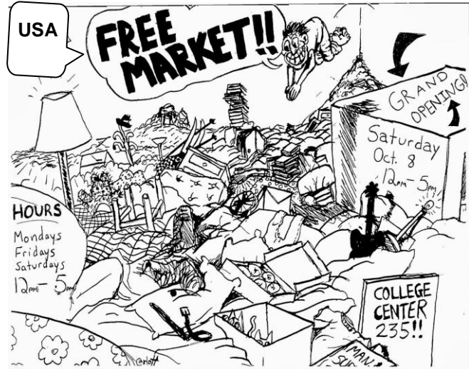
[Adapted from FOCUS Economics Grade 11 , Maskew Miller Longman]

By this he meant that although it seems there is someone making very efficient choices and decisions to make the economy run effectively, it is actually just what happens naturally when a number of people act as consumers in a market.”